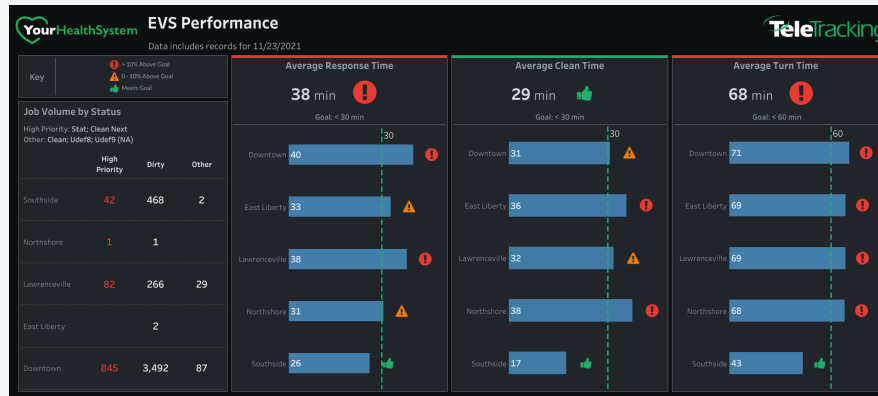
EVS Performance Screen

With SynapseIQ Enterprise Analytics, operational data is presented in an easy to consume format with the ability to drill-down for deeper analysis. Extensive customized configurations deliver unprecedented visibility to pinpoint inefficiencies such as room turnover times exceeding pre-determined thresholds and immediately identify the root causes.